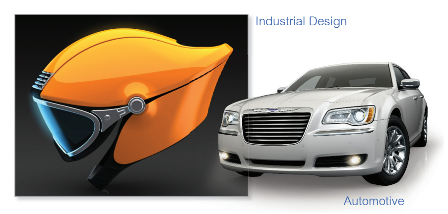
Photo-realistic rendering takes place in realtime. Any changes made to materials, lighting, or cameras are displayed immediately. This allows designers and engingeers to spend more time being creative and less time wrestling with technical issues and render times.